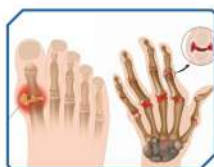
Gout & Arthritis